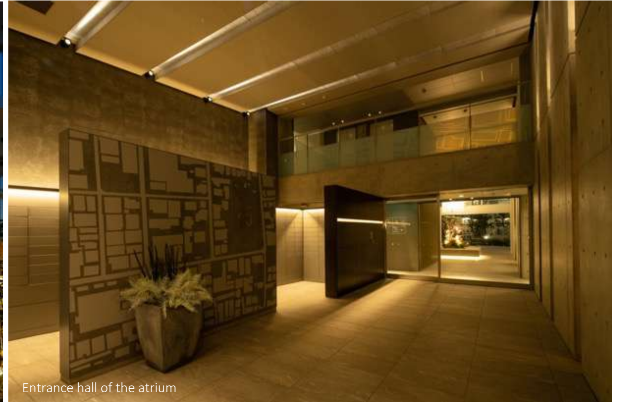
Entrance hall of the atrium