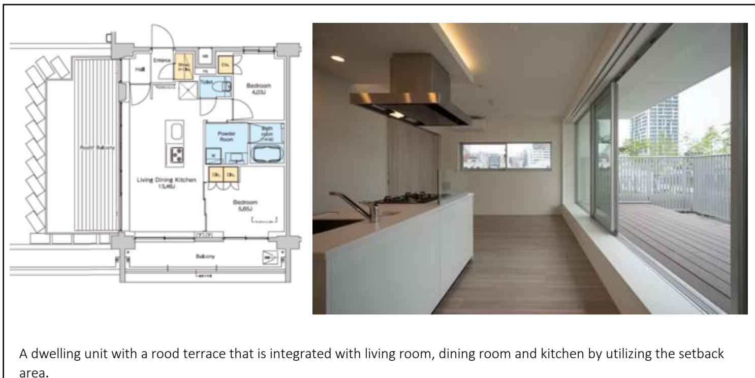
□ Dwelling unit with roof terrace 50,63 m 2