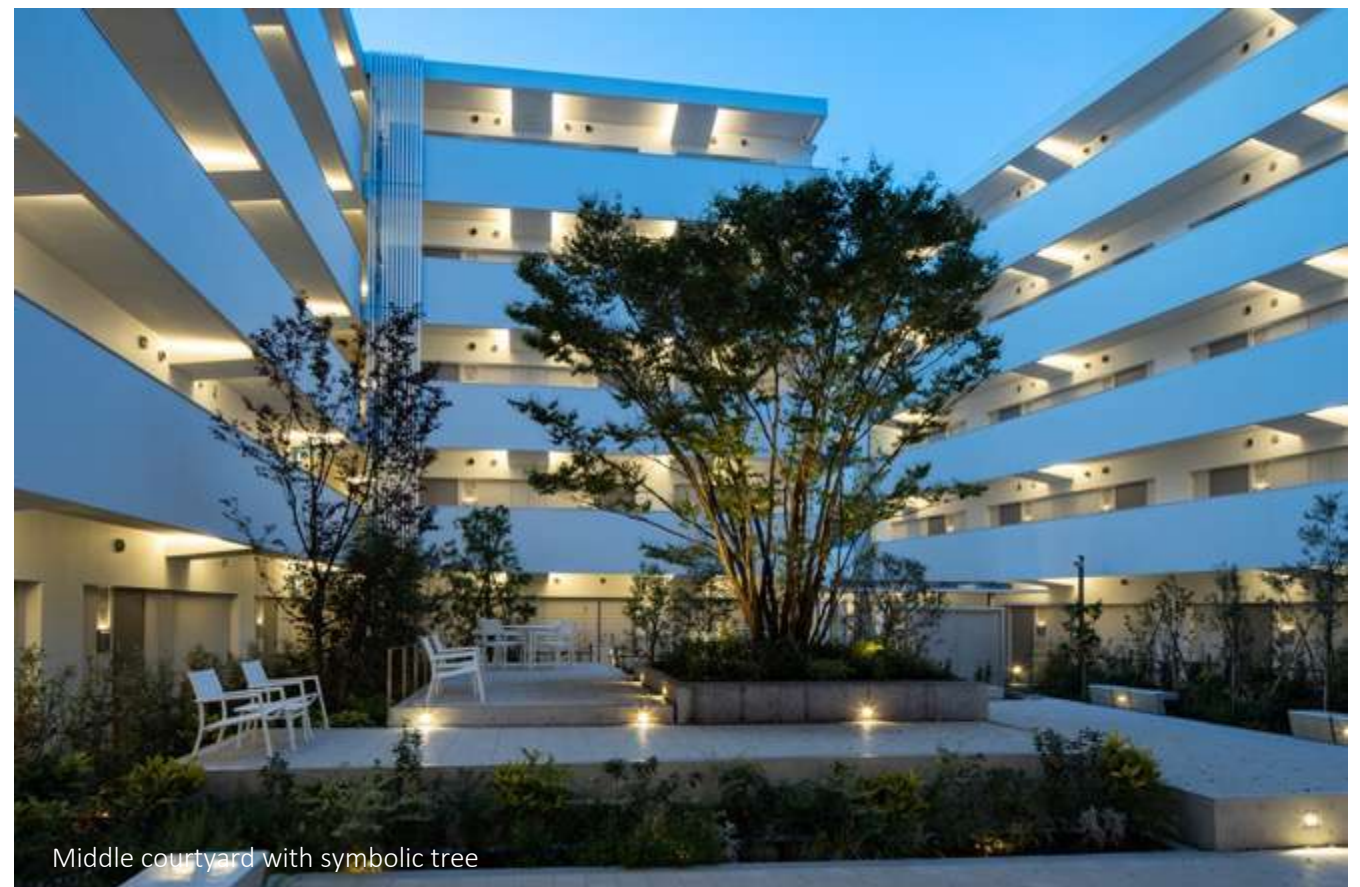
Middle courtyard with symbolic tree