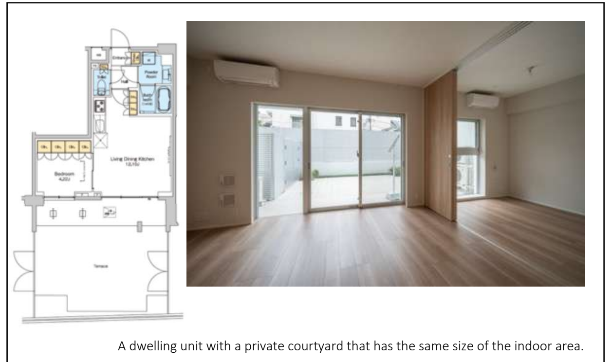
□ Dwelling unit with a large private courtyard 40,16 m 2