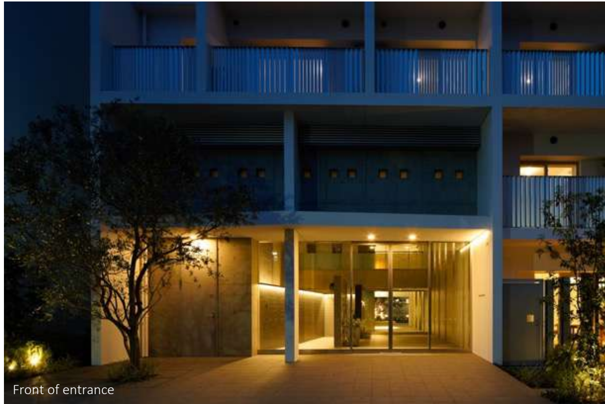
Front of entrance

The sequence from the entrance hall through the elevator hall to the middle courtyard is a dynamic space by positioning an atrium.