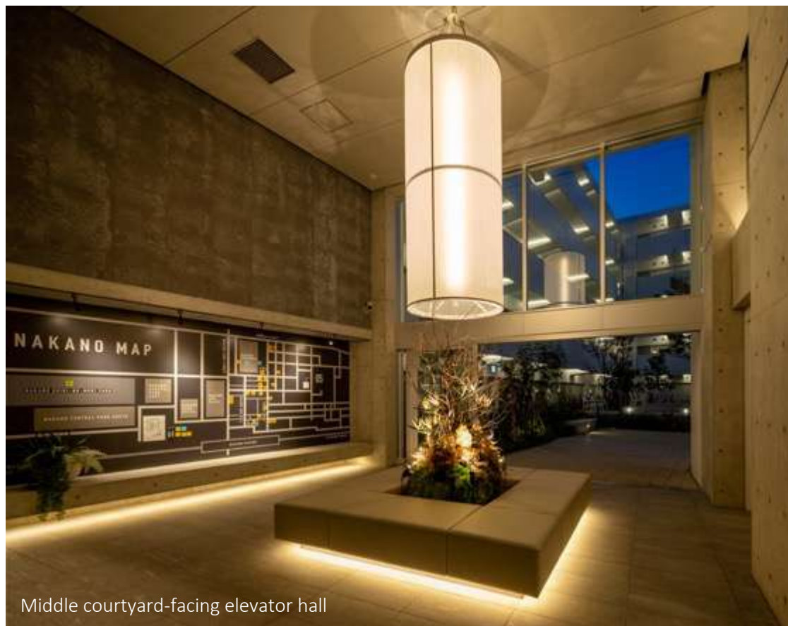
Middle courtyard-facing elevator hall