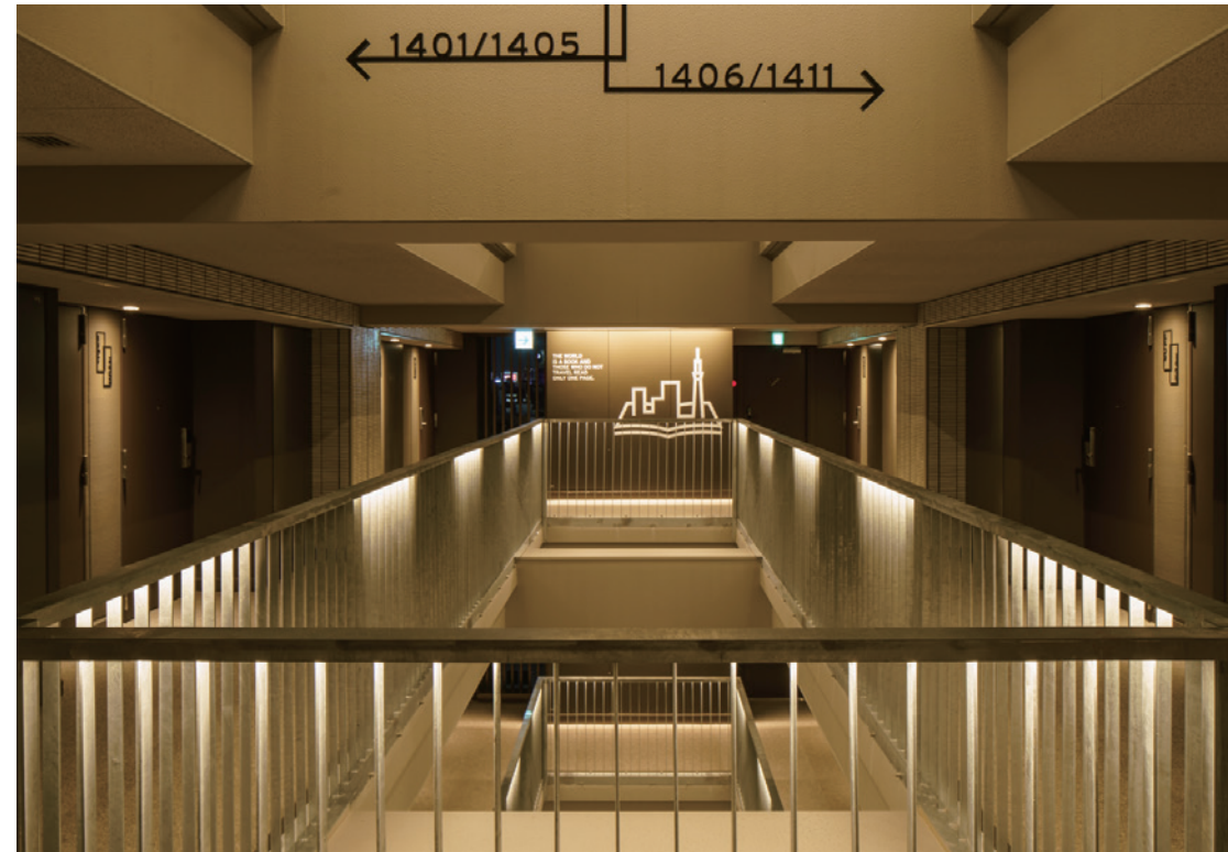
The front view of the atrium, where different words that related to traveling are graphically expressed