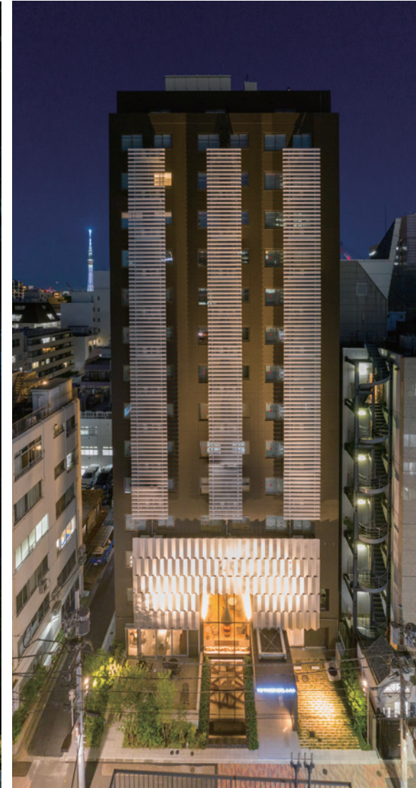
Full view of the front facade (night view)