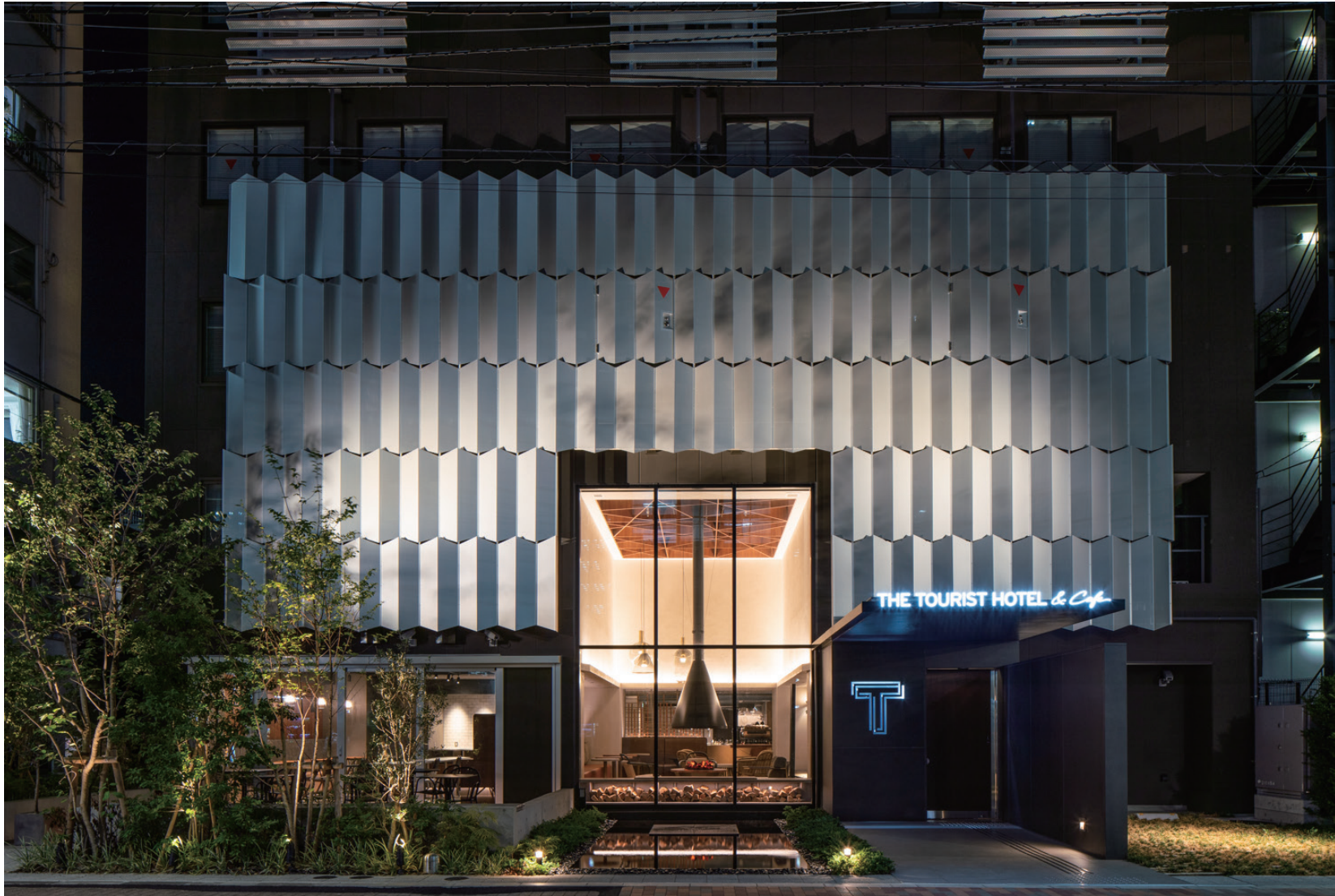
Night view of the front facade, where the Yagasuri pattern emerges