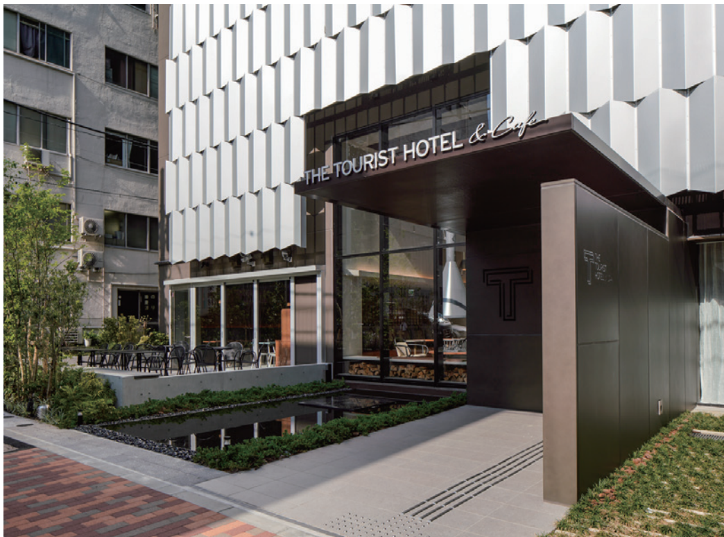
The entrance of the hotel that opens to the surrounding area