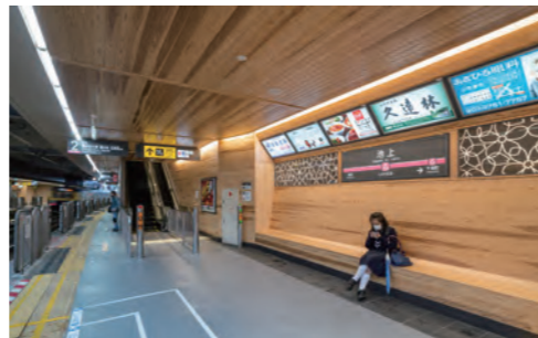
Platform with wooden walls and ceilings provides passengers a comfortable environment