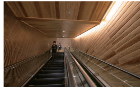
Escalator connecting platforms and ticket gates