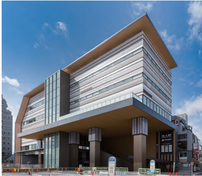
Full view of north exit