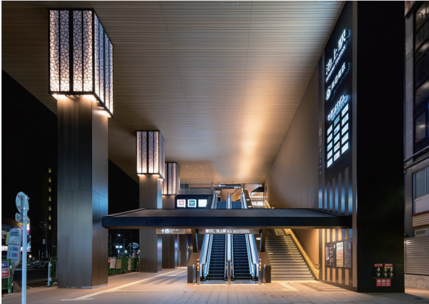
The north exit of Ikegami Station, which opens to the town with its landterns and sequence of columns with motif of "Oeshiki Sakura"