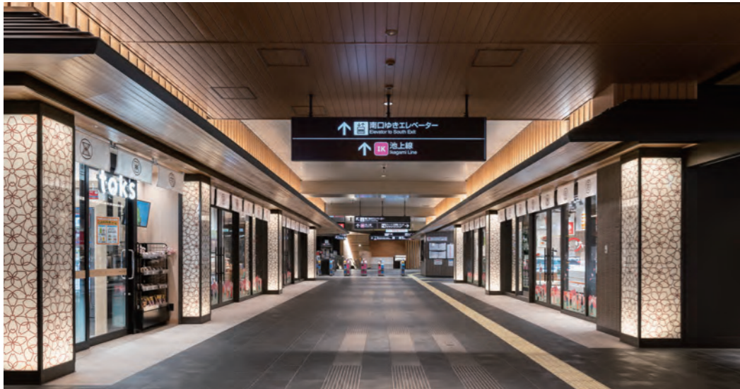
"Ikegami Nakamise" that provides the atmosphere of the approach to Ikegami Honmonji when people exit ticket gates