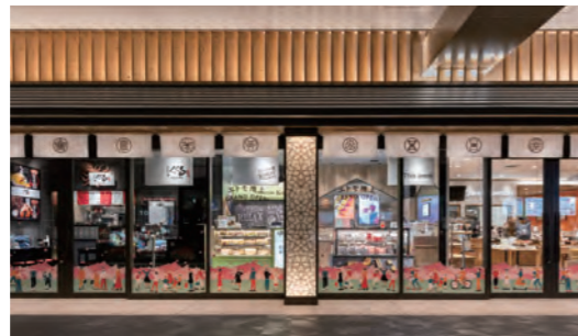
"Ikegami Nakamise" with designed symbols on the shops' curtains