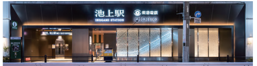
Night view of south exit