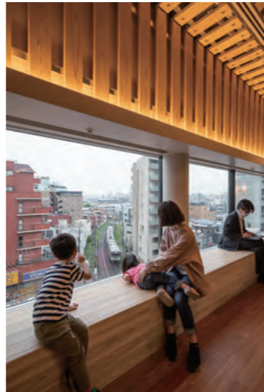
Children overlooking the train