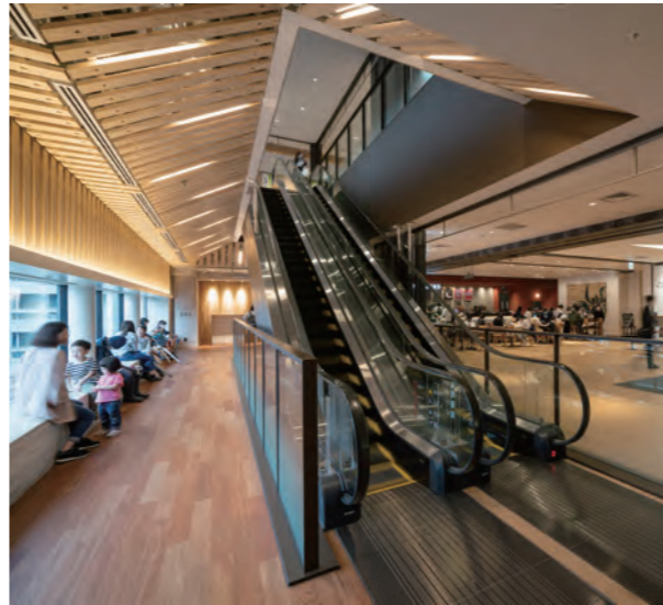
Library and cafe on the 4th floor, benches are set by the window beside the escalator