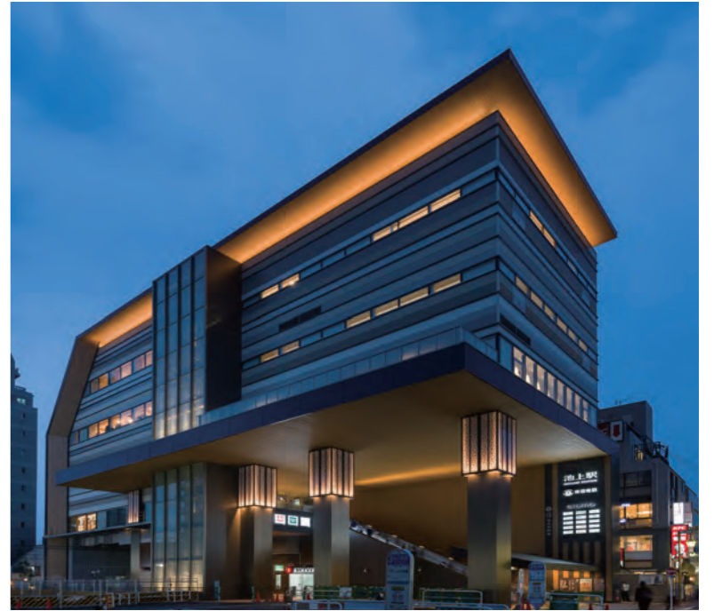
Night view of north exit