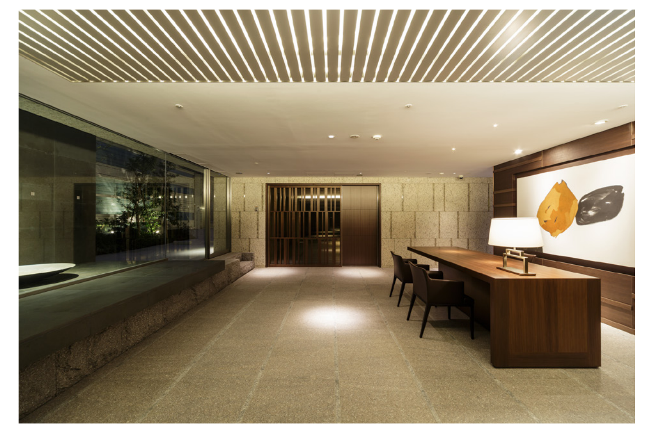
Entrance with artworks