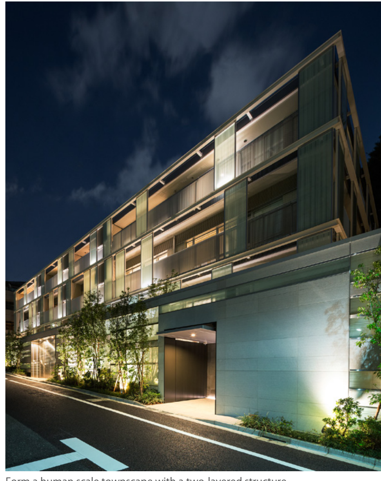
Form a human scale townscape with a two-layered structure