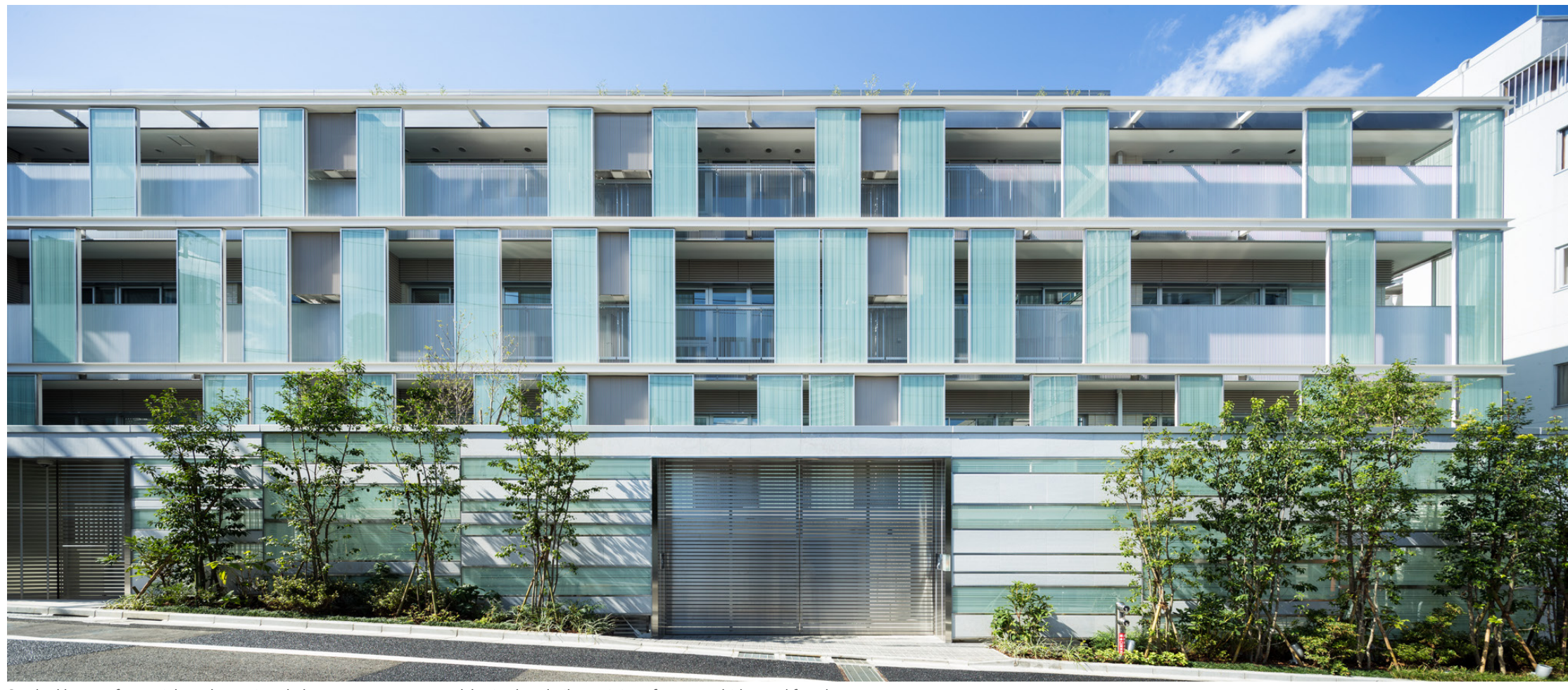
Stacked layers of materials such as printed glass screen, stone, metal, lattice handrail, etc., it is to form a multi-layered facade