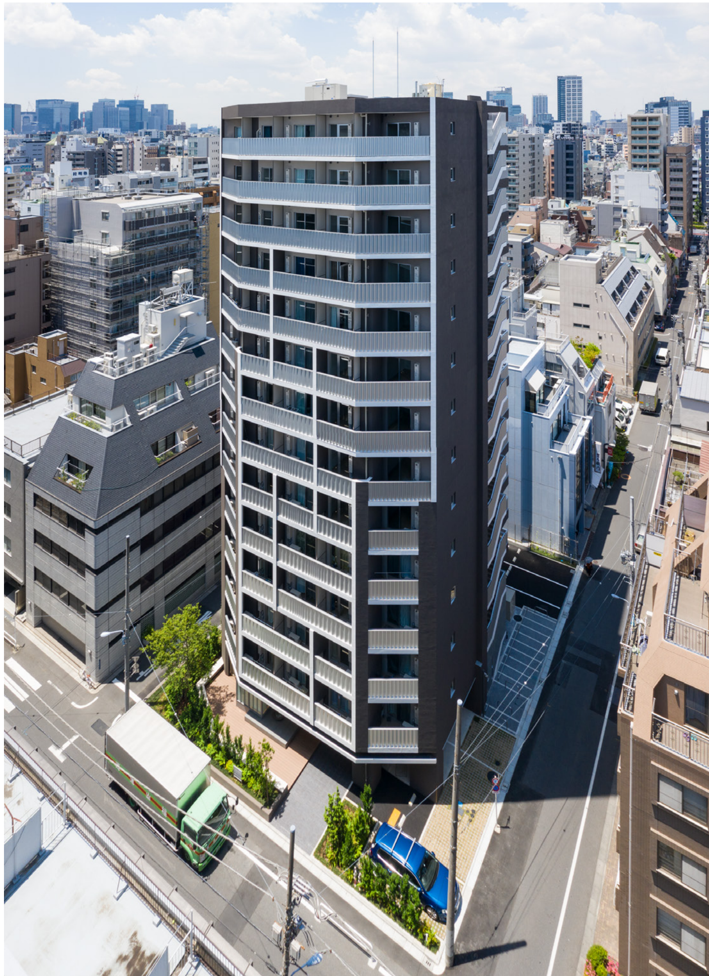
The bottom part is setback due to the sky factor. It functions as a semi-shared space of the street.