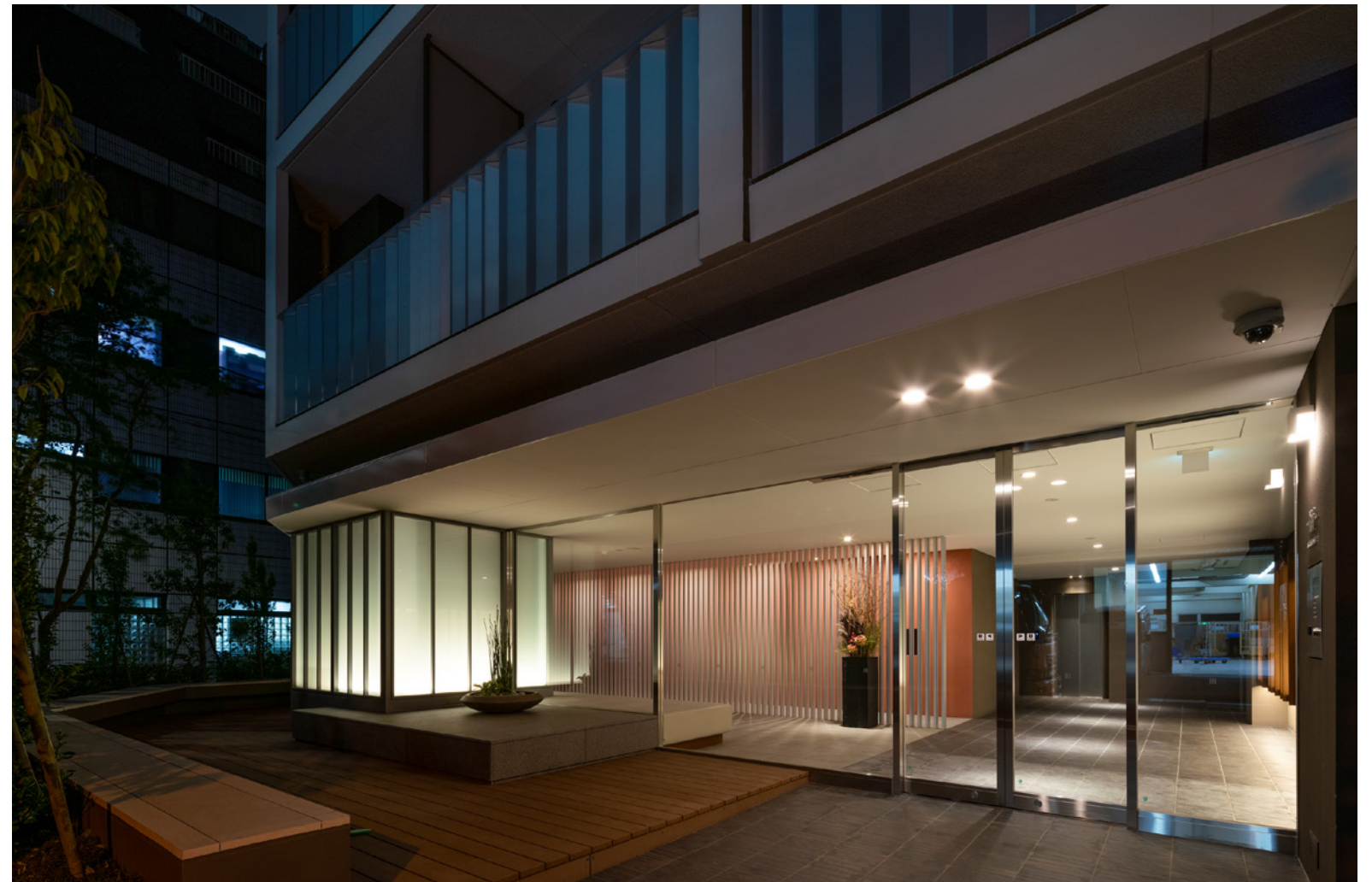
Shared area on the first floor with a lantern column centered around a deck terrace and an entrance hall