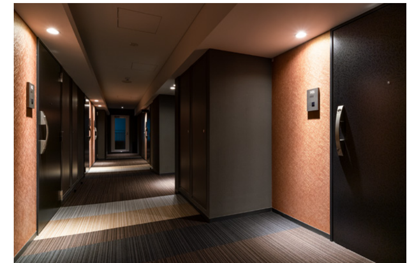
The color of the wall is appealing around the entrance of the dwelling unit