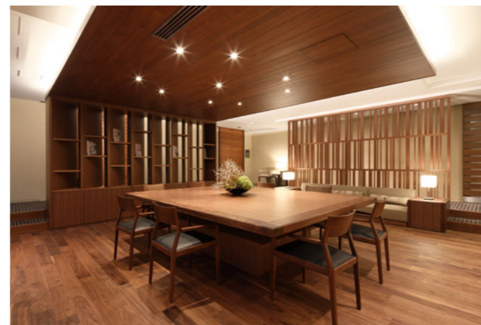
Lounge that can also be used as coworking space