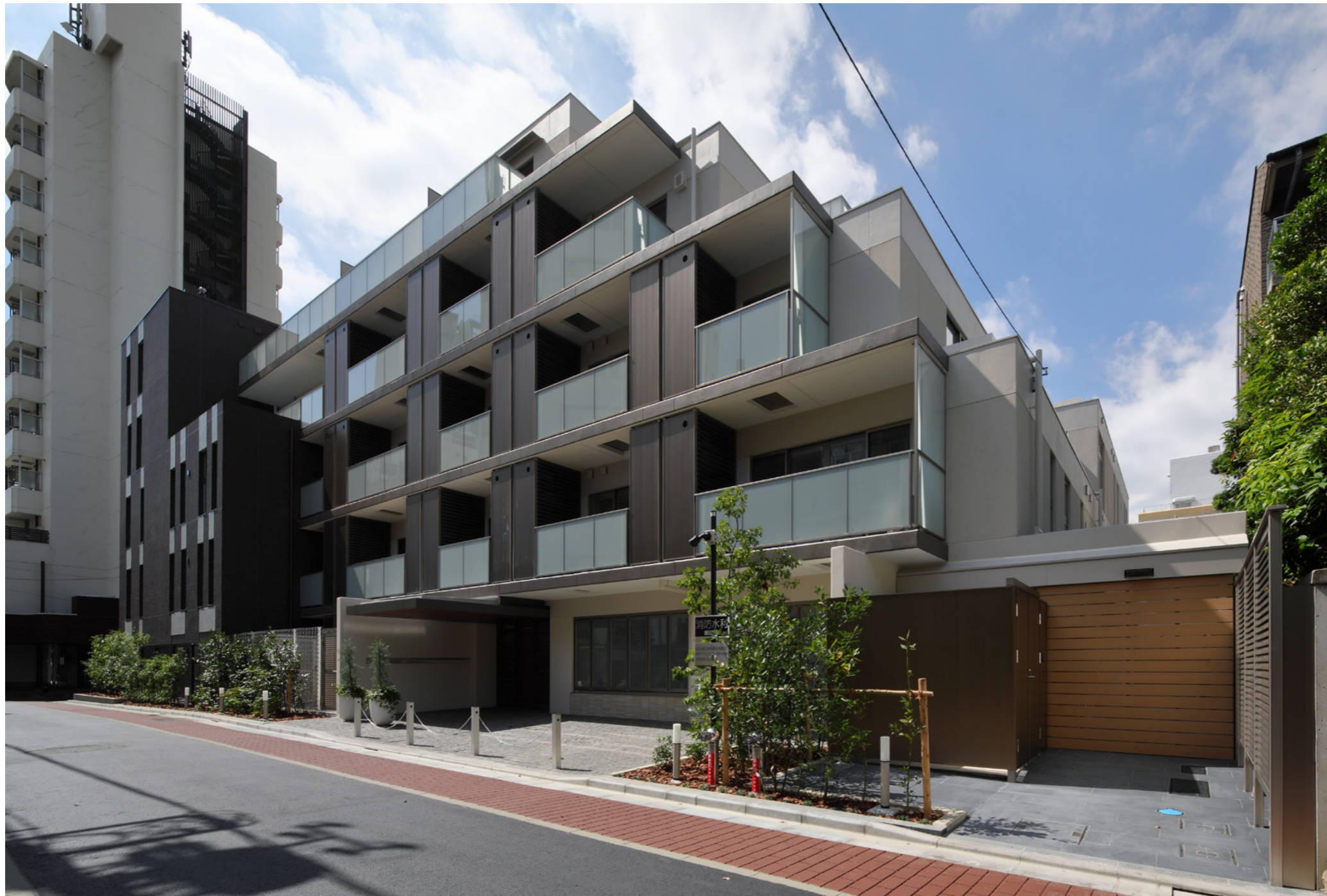
East facade with the entrance