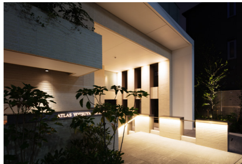
Street facing wide-open entrance