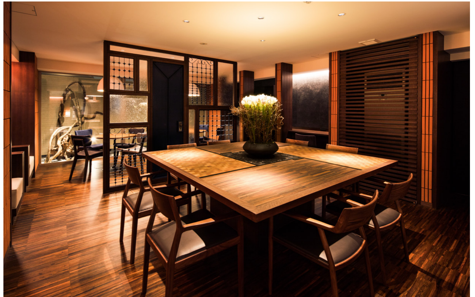
The lounge has partition with existing parts combined and memorial corner