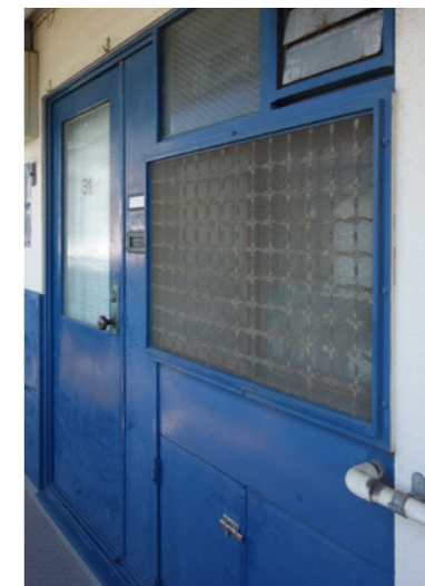
Blue painted "Yotsuya Corporate House" dwelling unit entrance